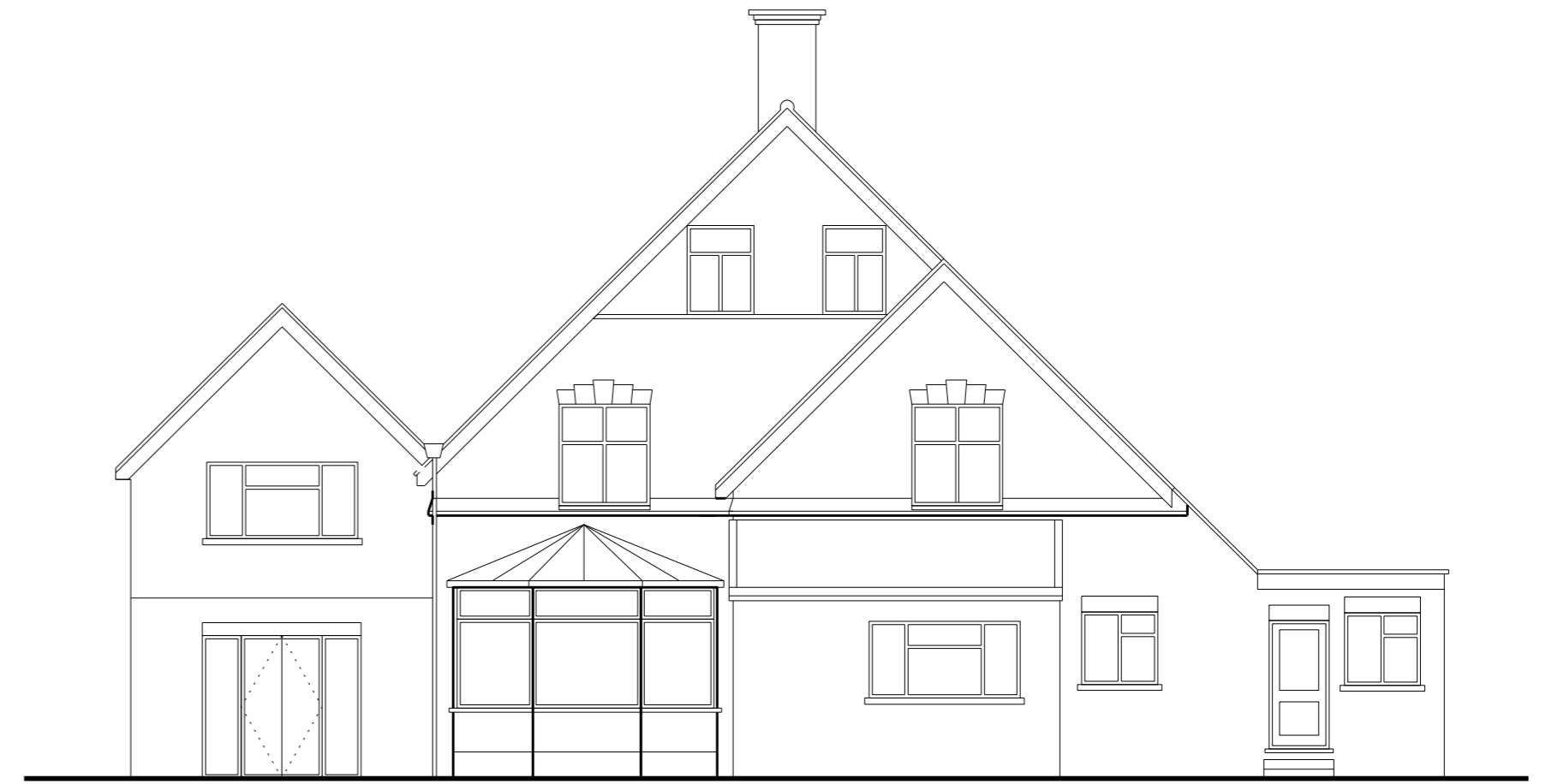
02 | EXISTING REAR ELEVATION