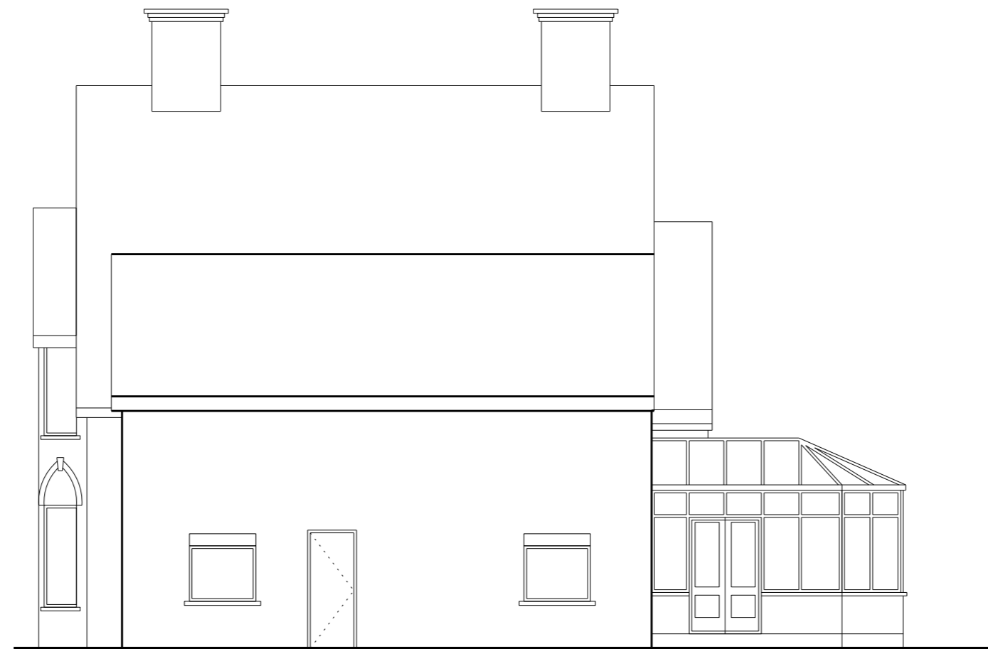
03 | EXISTING SIDE ELEVATION