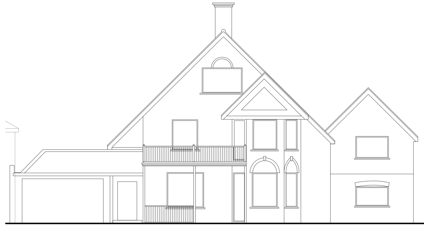
01 | EXISTING FRONT ELEVATION